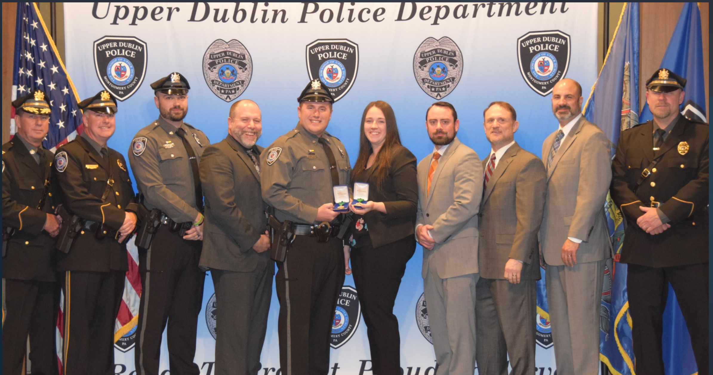
Commendation Ceremony – Letter, Merit, Heroism