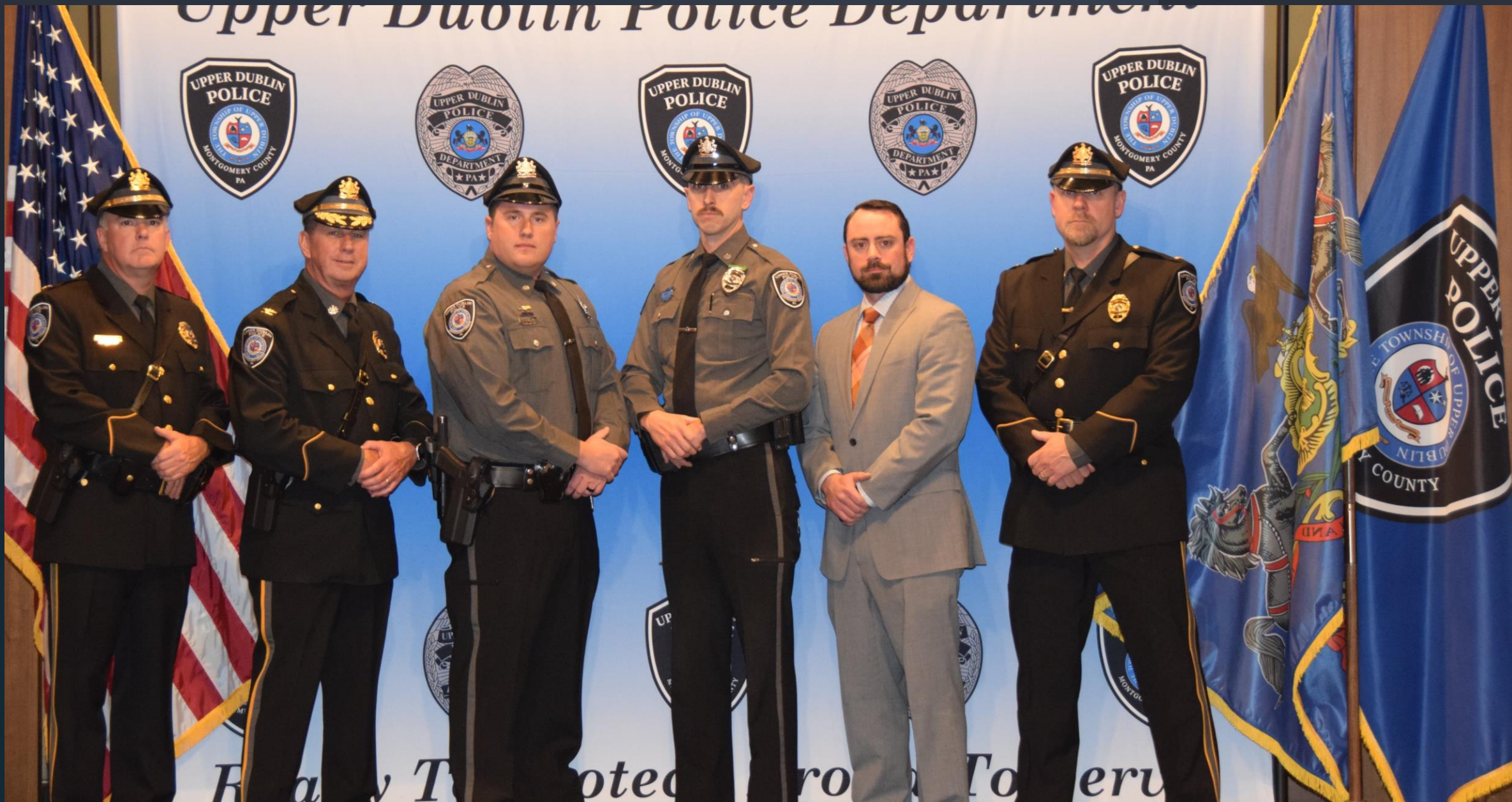
Commendation Ceremony – Merit