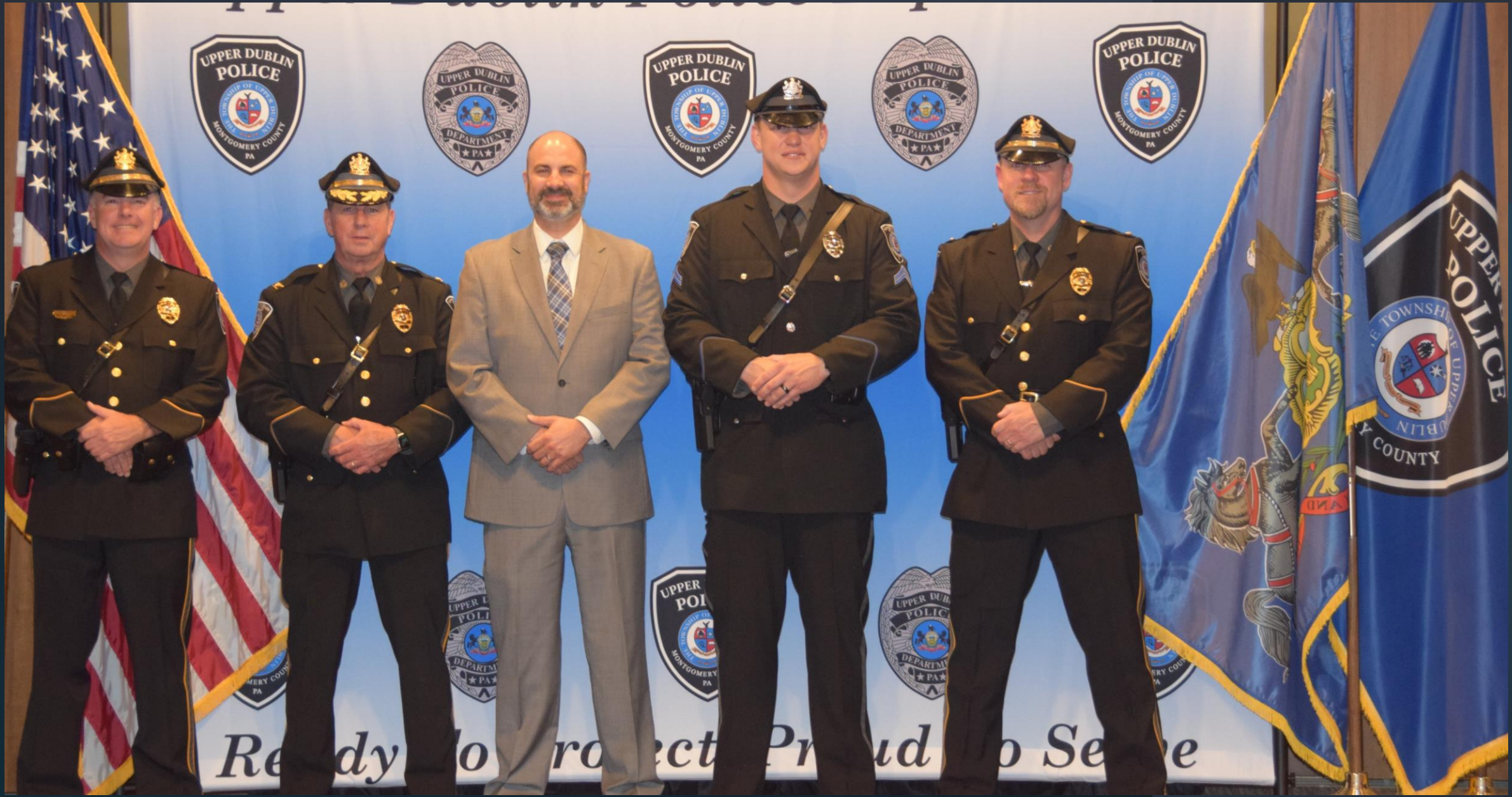
Commendation Ceremony – Letter