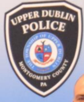
Commendation Ceremony – Letter & Merit