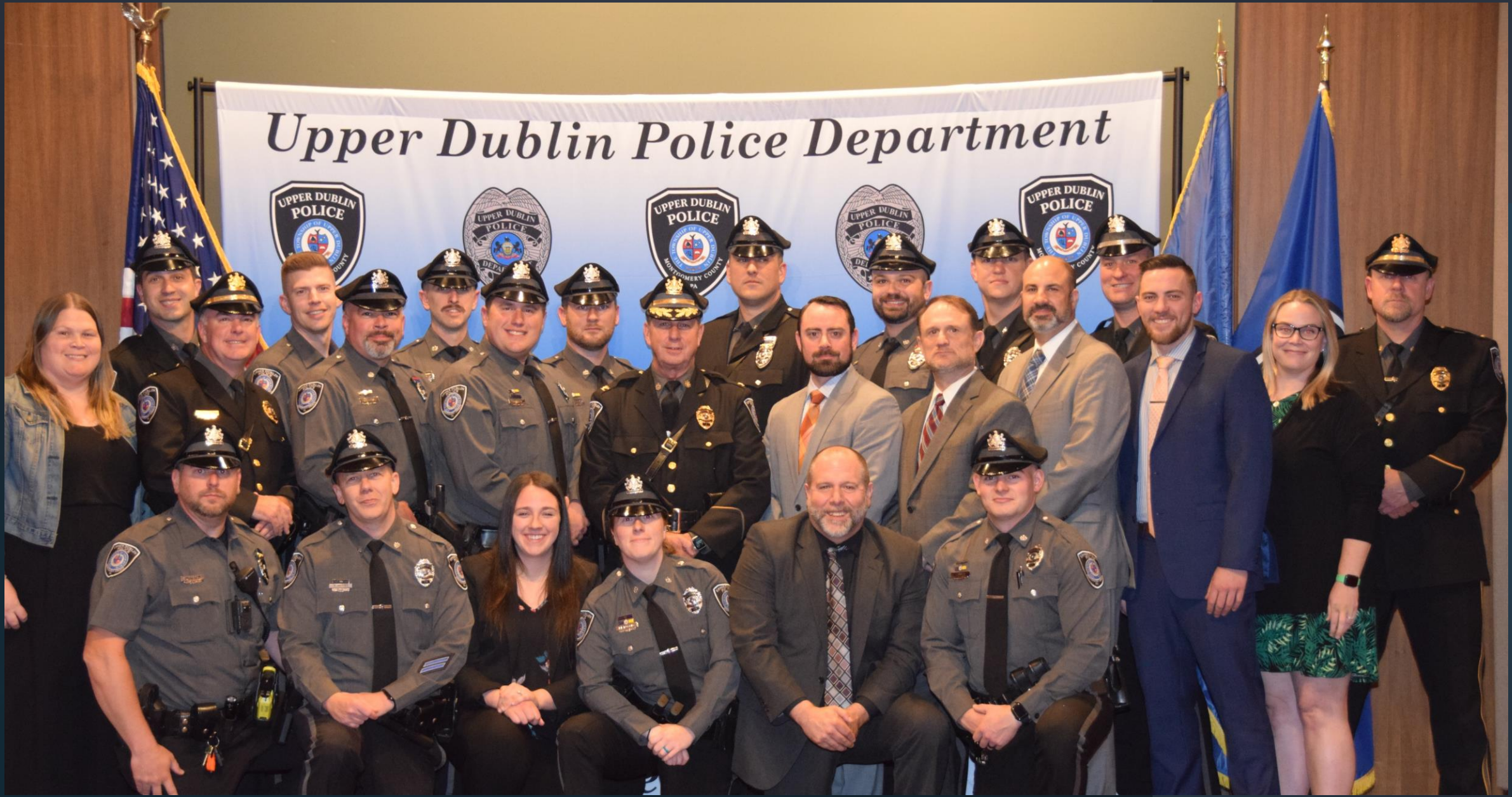
Upper Dublin Police Personnel