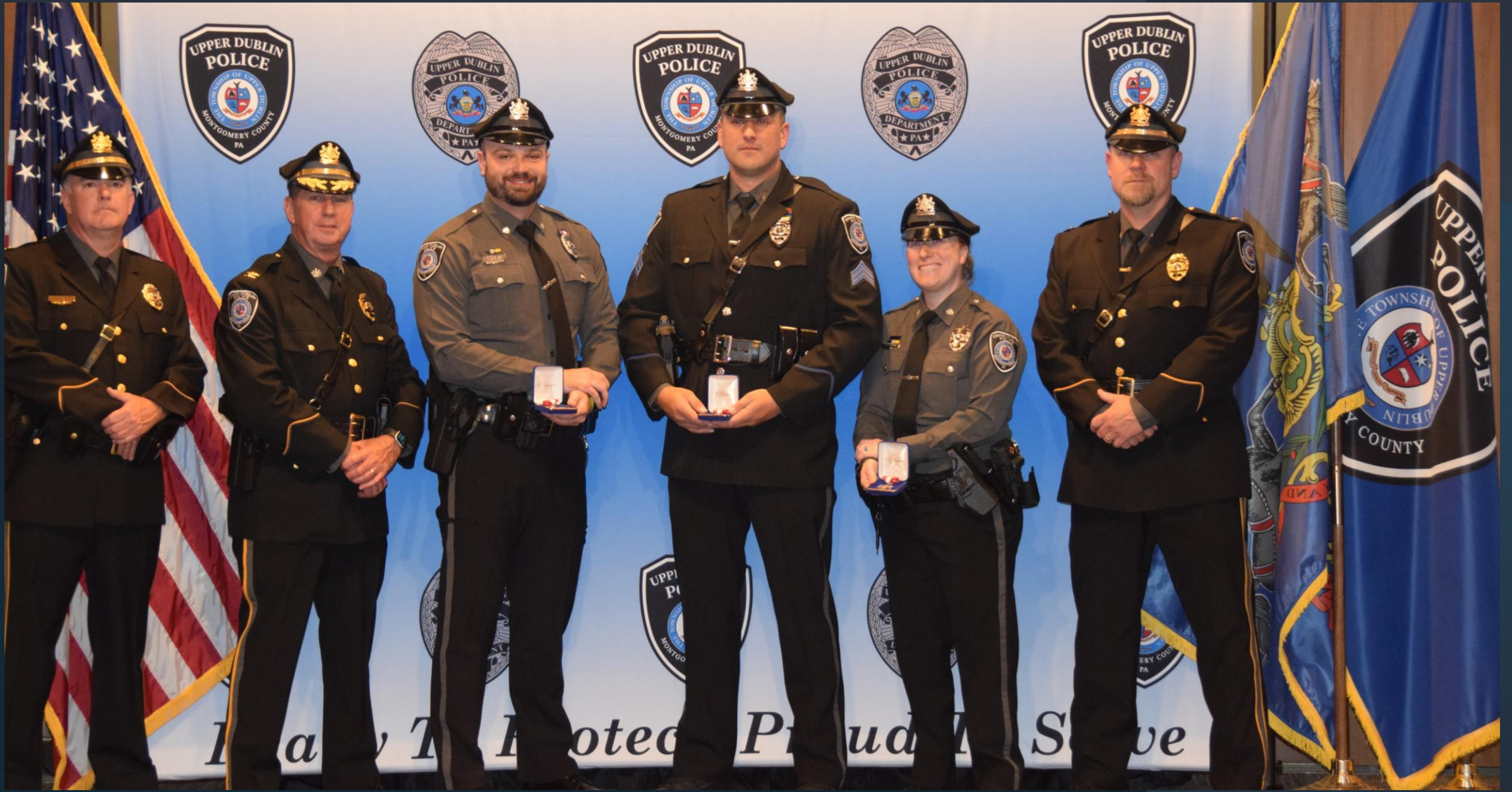
Commendation Ceremony – Lifesaving