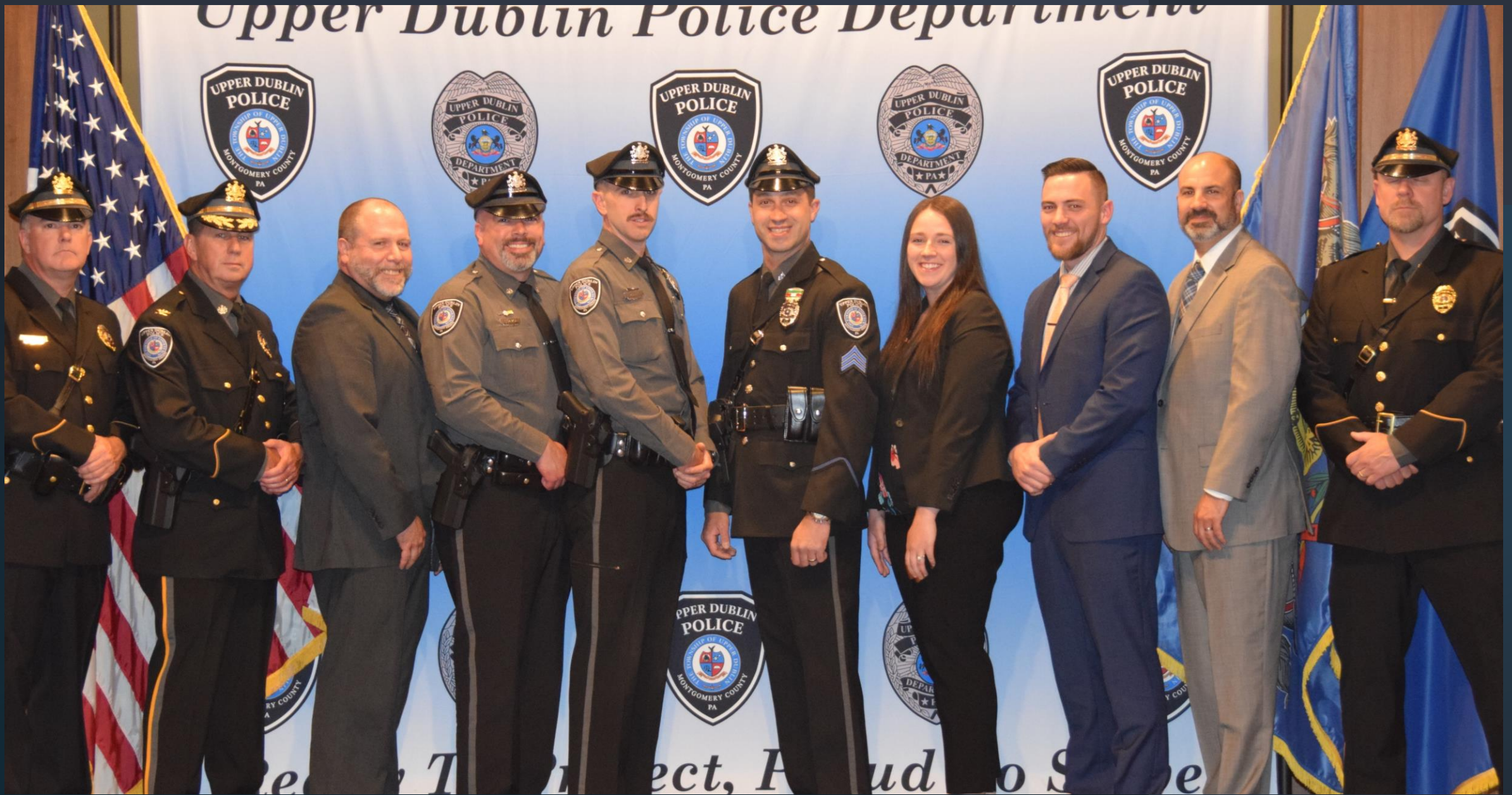
Commendation Ceremony – Letter & Merit