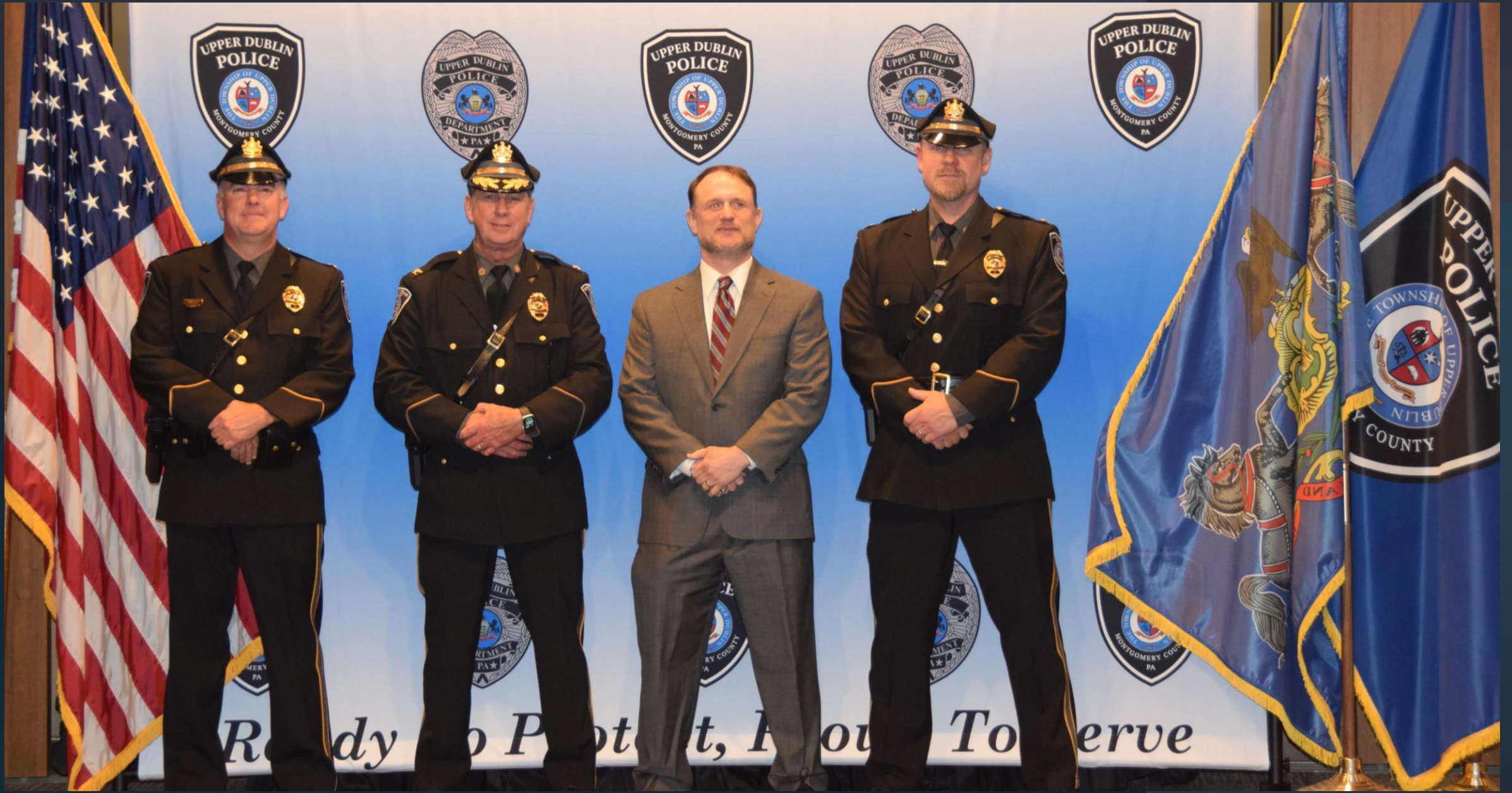
Commendation Ceremony – Letter