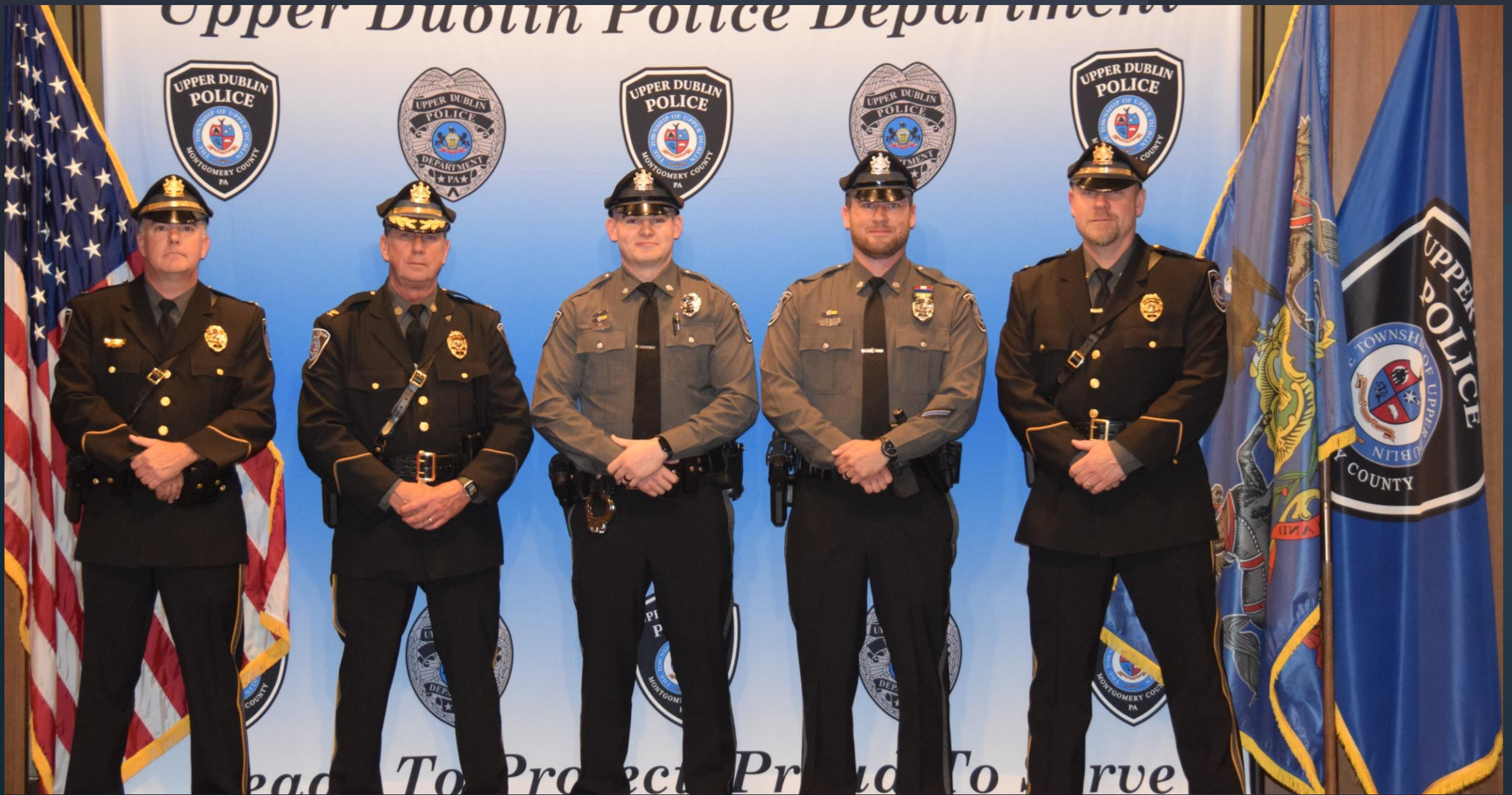
Commendation Ceremony – Merit