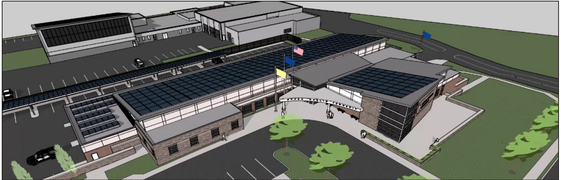
SOUTHEAST SITE VIEW