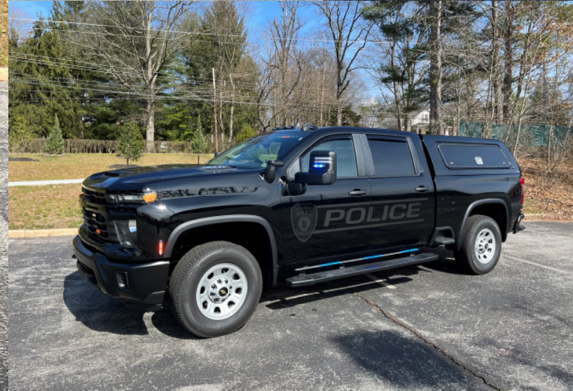
Patrol Vehicle 41-12 ~ Motor Carrier Enforcement