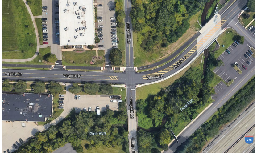
Virginia Drive & Camp Hill Road Intersection

Construction for the new traffic signal and associated intersection road work is now complete. Turns are permitted, except for left turns from Virginia Drive onto Camp Hill Road (both directions). The project cost approximately $600k with $50k funding from the MA and the remaining funds obtained through a Montgomery County grant and Land Development commitments.